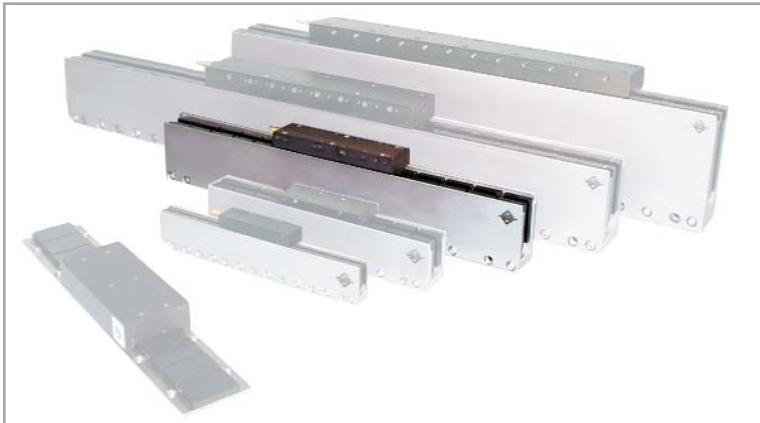
The BLM is shown with Aerotech's linear motor line.

The BLM can be driven using standard Aerotech brushless amplifiers and controllers to provide a complete integrated system.