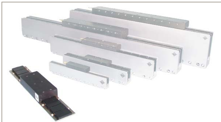
The BLMF is shown with Aerotech's linear motor line.

Offering high peak forces in its standard configuration, BLMF motors are available with higher-power magnets that can be used to increase output force.