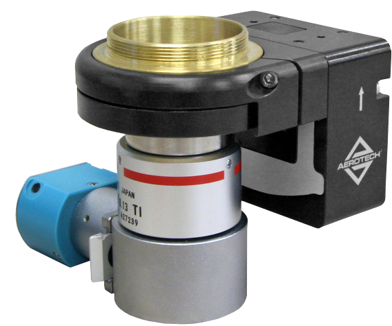
The QFOCUS QF50Z shown with a Michelson interferometry objective used in 3D optical surface profilers.