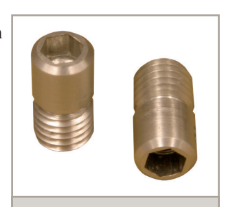
Replaceable O-ring seals are available to support wet cutting of 0.5 mm to 5.8 mm tubing.

The low maintenance and high throughput characteristics of the ASR1200 provide a stage that yields the lowest total cost of ownership while the integral water jacket and pneumatic collet provide unmatched levels of integration and ease of use.