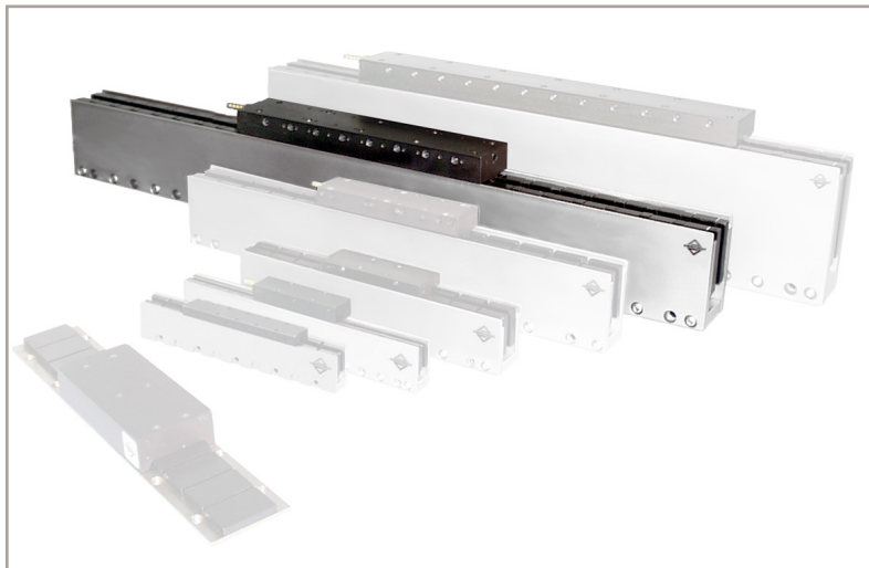
The BLMH is shown with Aerotech's linear motor line.

The BLMH can be driven using standard Aerotech brushless amplifiers and controllers to provide a complete, integrated system.